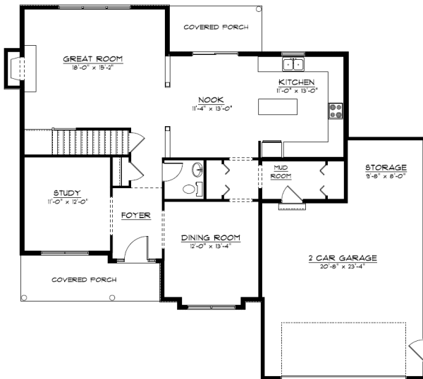
FIRST FLOOR PLAN LEXINGTON MODEL