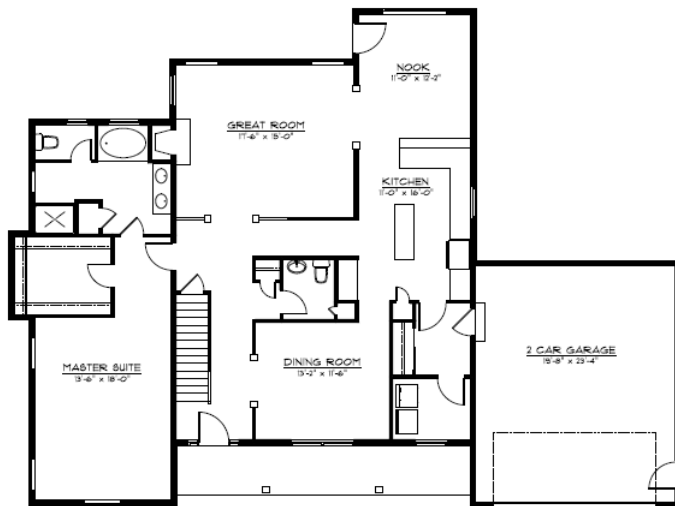
FIRST FLOOR PLAN CROSSWINDS MODEL 2806 SQ. FT.